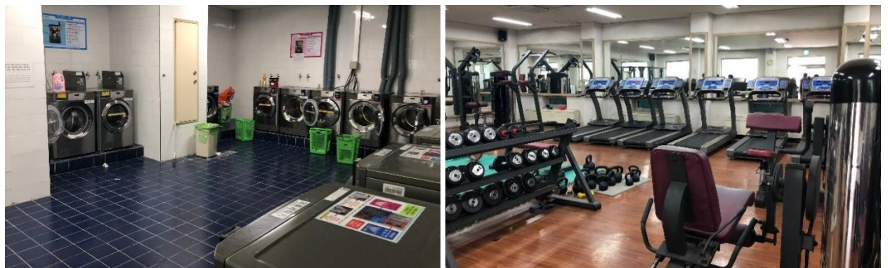
<Laundry Room and Gym>

The Dormitory and International House provides coin-operated laundry rooms and a gym for its residents' use. These are located on the basement floor and open 24 hours. Seminar rooms, student lounges, and an internet café are also available for the residents.