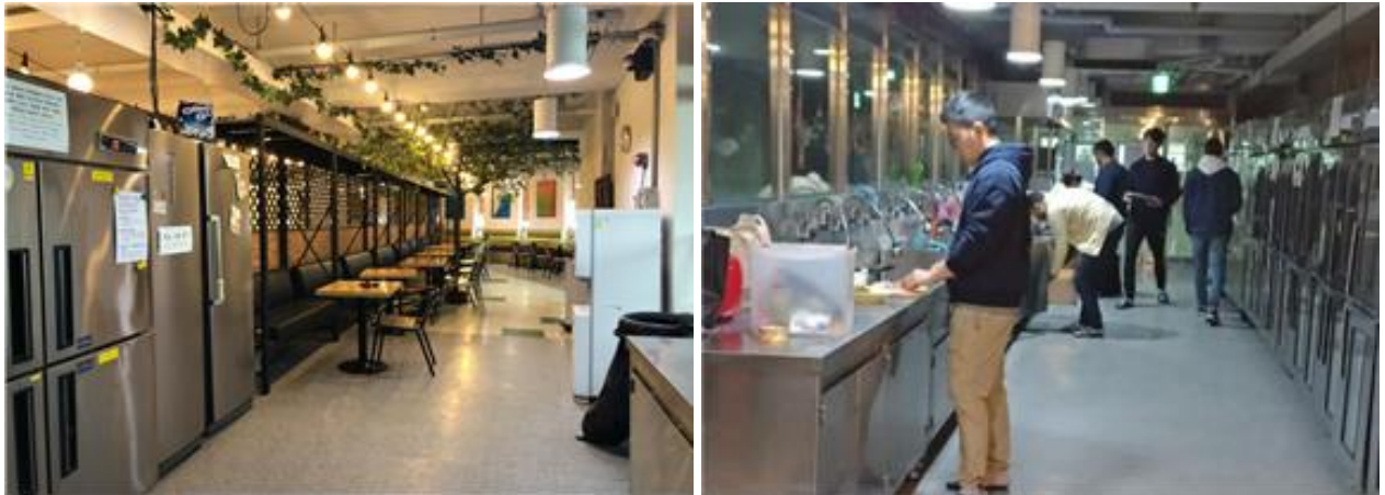
<Community Kitchen & Cafeteria>

electric voltage in Korea is 220V (60hz), and the standards wall socket has two rounded holes. Due to fire hazard reasons, any cooking device that results in fire is strictly prohibited in the room. The dormitory has a community kitchen for students to cook their own food occasionally. Many international students use this community kitchen to cook their own ethnic food and share it with other international or Korean students.