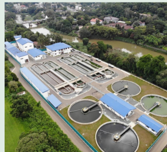
TEMPLE OF TOOTH RELIC | UOP | KCC | KCWWTP